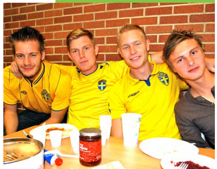
Wilmington College International Festival

www.wilmington.edu/admission/international-students/